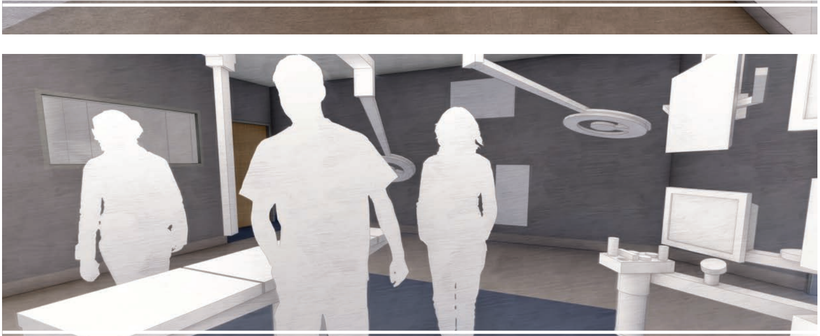
4 new, large and spacious operating suites equipped with advanced technology.