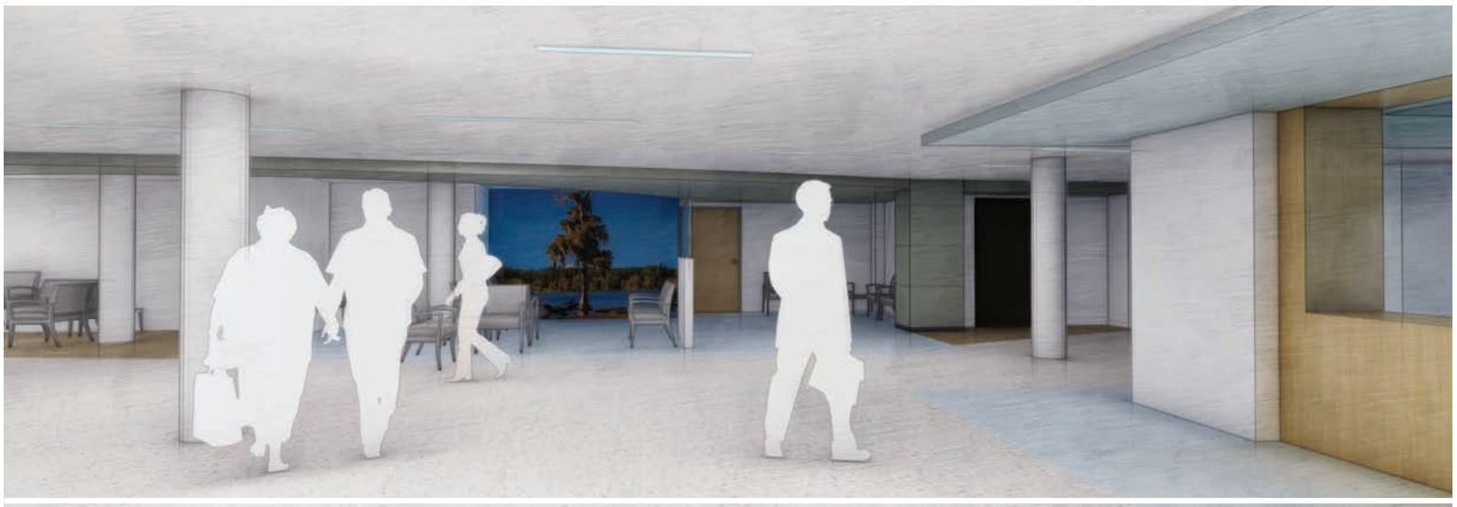
Patient registration and Surgery pre-admit areas relocated to front entrance.